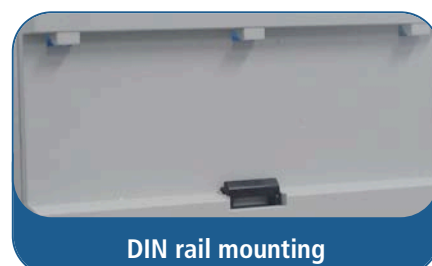
DIN rail mounting