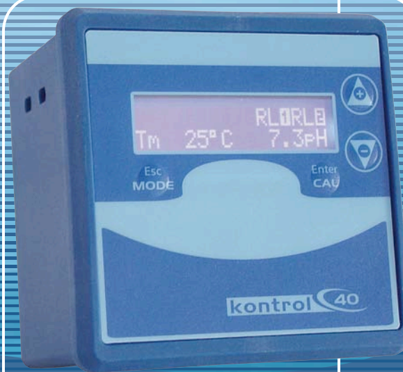
Panel version (96x96x92 mm)

SEKO Asia Pacific SINGAPORE • SEKO China CHINA • SEKO do Brasil BRAZIL • SEKO Dosing Systems USA • SEKO Southern Africa SOUTH AFRICA • SEKO Deutschland GERMANY • SEKO France FRANCE • SEKO Iberica SPAIN • SEKO Italia ITALY • SEKO SIETA ROMANIA • OOO SEKO RUSSIA • SEKO UK UNITED KINGDOM