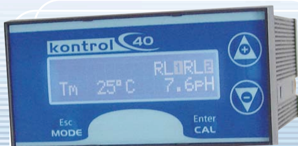
Panel version (48x96x100 mm)

pH/Redox and Conductivity Meter Instruments