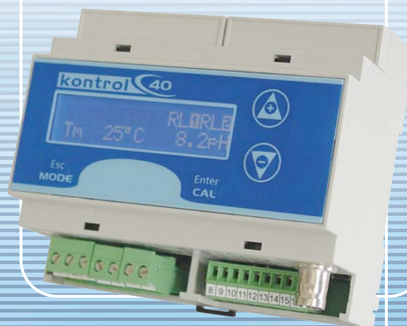
DIN Rail version (6 moduls EN50022)