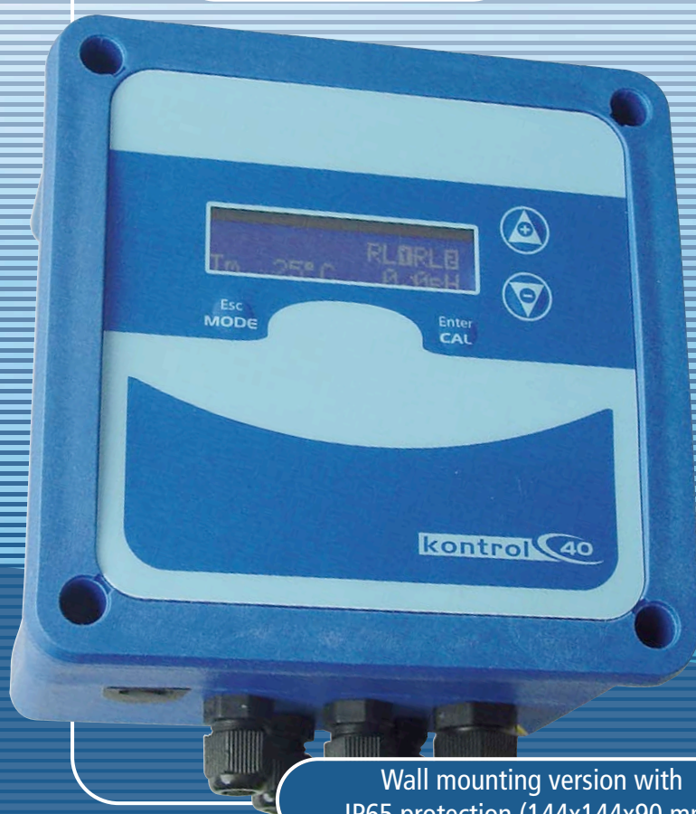
Wall mounting version with IP65 protection (144x144x90 mm)